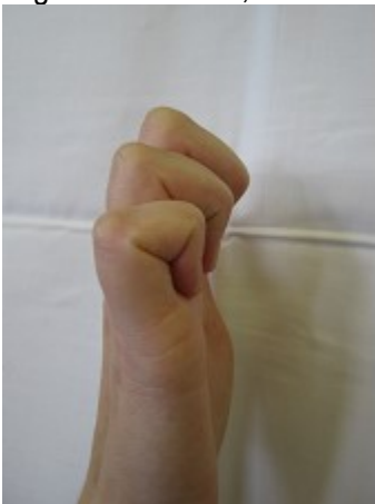
4) From straight, curl your fingers into a hook, as below