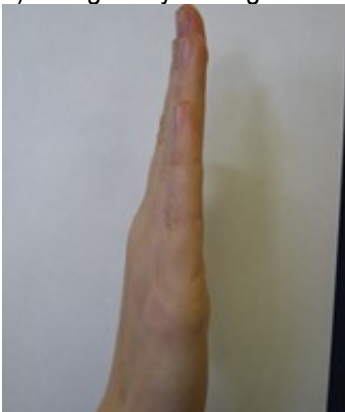
7) Straighten your fingers