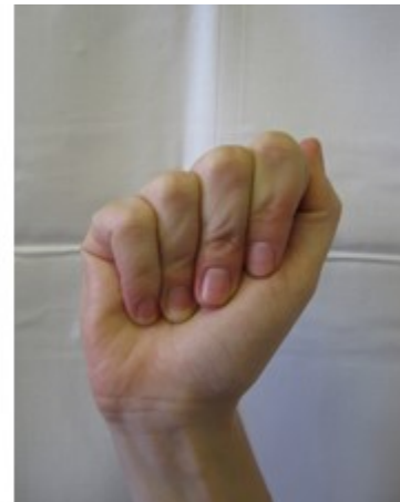
6) From straight, make a flat fist, as below