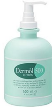
Dermol 500 Lotion