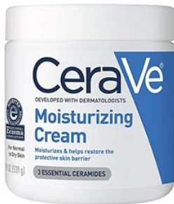
CeraVe Moisturizing Cream