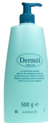
Dermol 500 Cream