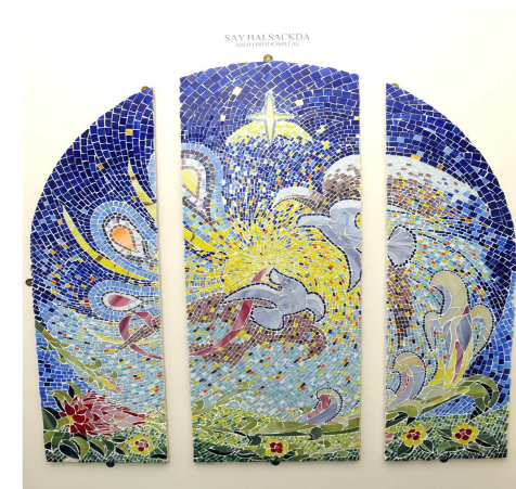
Mosaic design at the entrance to Ashford Hospital Chapel

The Ashford Hospital Multi-Faith Centre is close to the main Hospital Entrance.